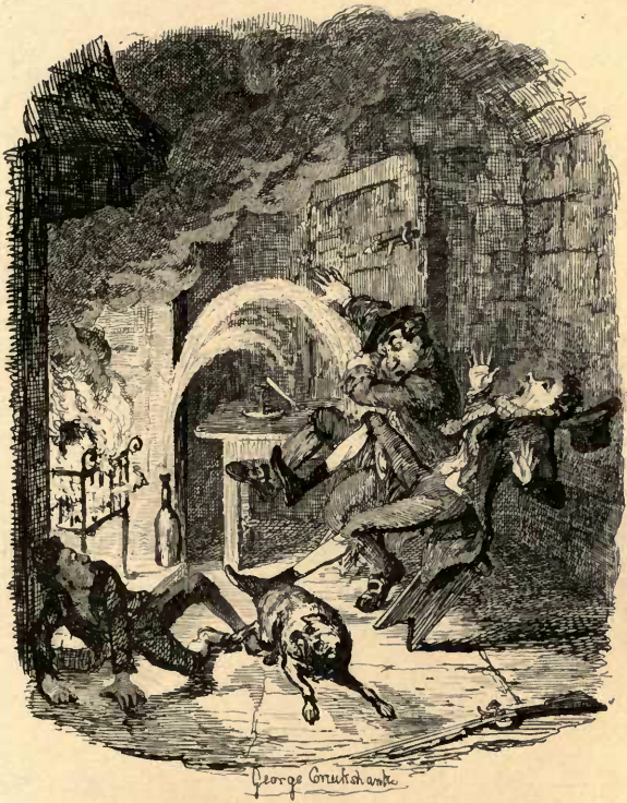
The Bursting of the Porter Bottle.